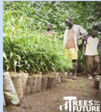
Our goal is to give back to communities and to do our part to replenish national forestry, driving sustainability.

As a company that specializes in building customized wood crates to protect valuable assets, our contribution to greater sustainability starts with replenishing the natural resources we use through two key initiatives.