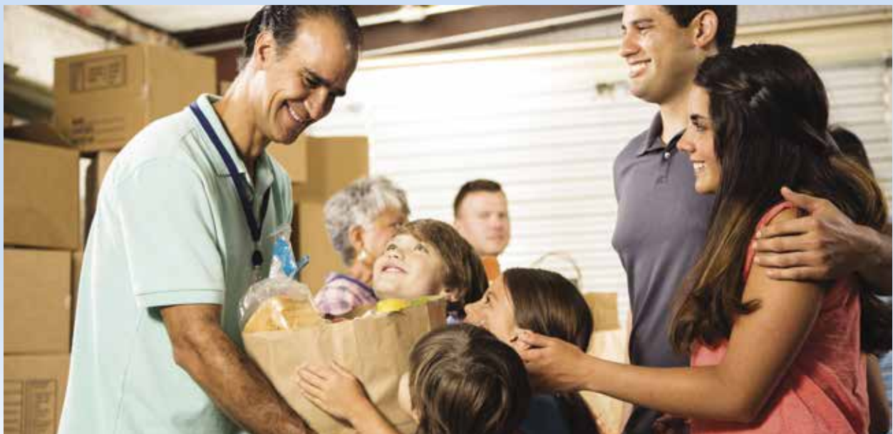
Distributing food and water during and after natural disasters has been a natural response for many C&F locations.

The goal is both to let them know that we (and the world) deeply appreciate what they’ve done and to encourage others to take an active role in supporting the causes they’re passionate about. Similar to our tree-planting initiatives, we’ve found that Crates for a Cause plants seeds that are blooming into actions that make the world a more beautiful place.