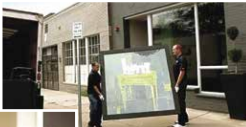
Making the difficult—easy